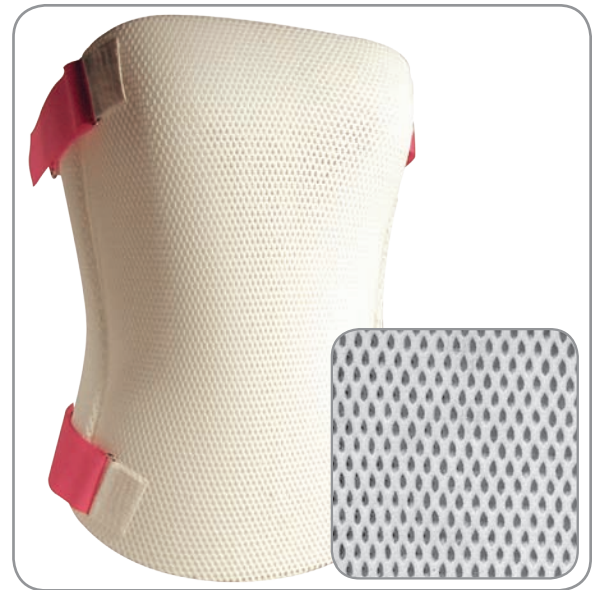
See Materials Catalog 2007/08, #90 (page 62)