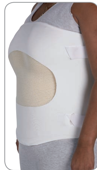
3D-Lite Cut-4-Custom for LSO's and TLSO's