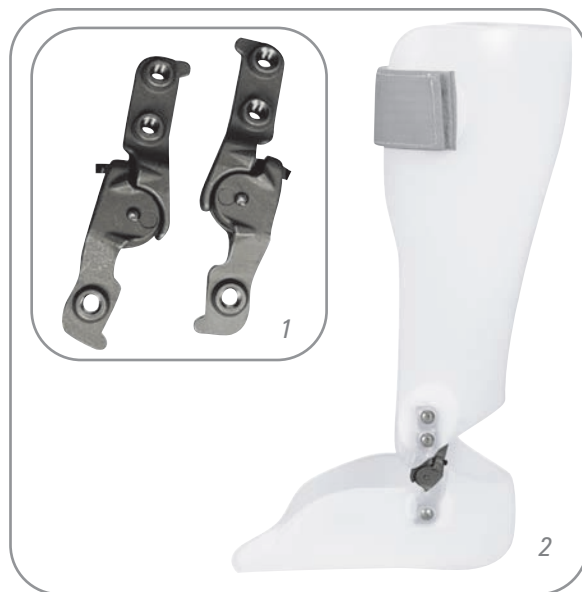
1 = Tamarack Clevisphere™ Ankle Joint 2 = Clevisphere™ used on a molded AFO