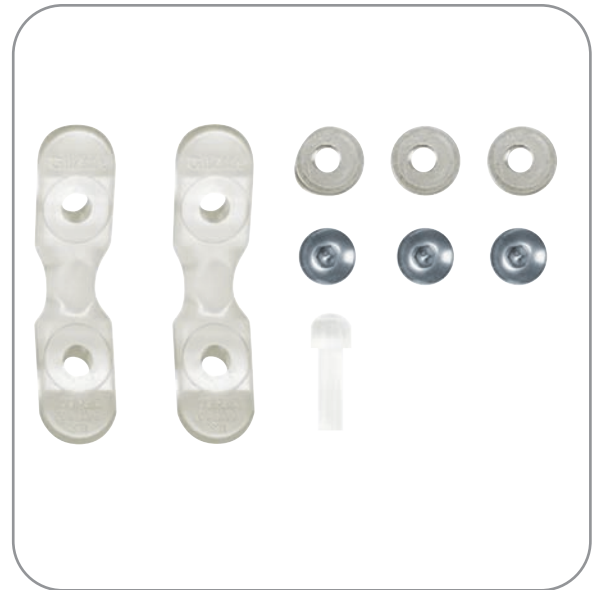
Model 775 - Gillette Double Flexure Ankle Joint