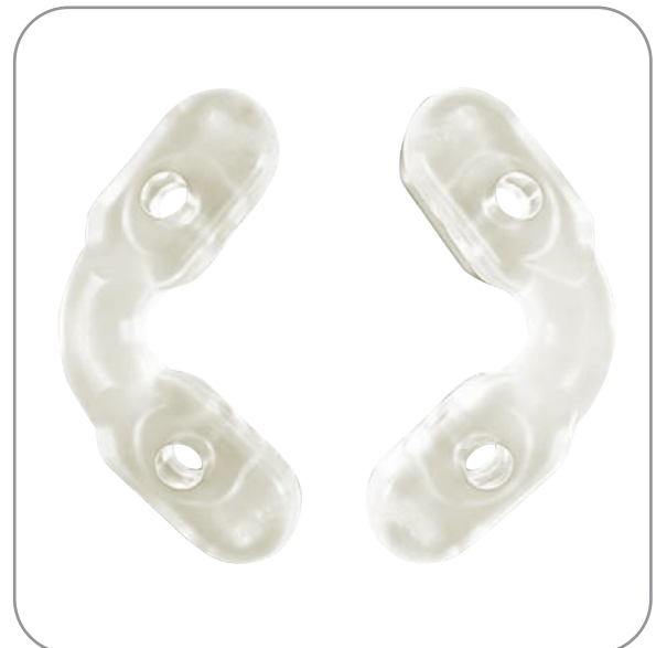
Model 776 - Gillette Dorsiflexion Assist Ankle Joint