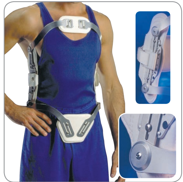
Model Q-26A (with stationary sternal pad and quick release)