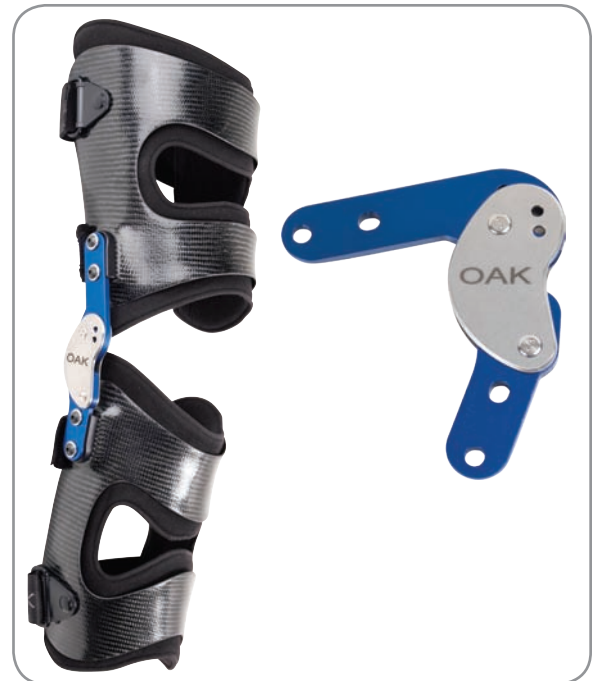
Left: OAK Orthosis with TFC cuffs. Cuffs also available with Kydex® and ABS. OAK Short orthosis available with ABS cuffs only.