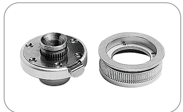
With Laminating Ring