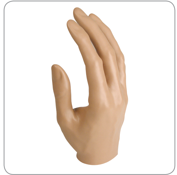
Hosmer Cosmetic Glove Measurement Chart