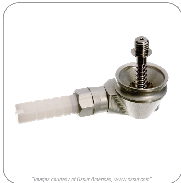
ICELOCK Clutch 211