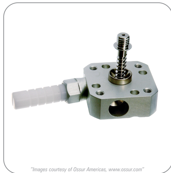
ICELOCK Clutch 214