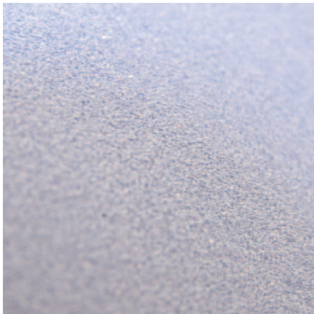
Detail of SHOCKtec Air2Gel™ abraded side.