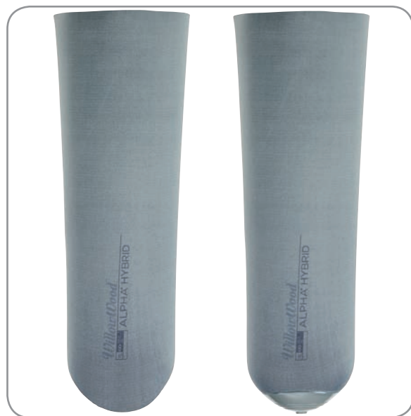
Alpha Hybrid AK Liner with Symmetrical Gel Style