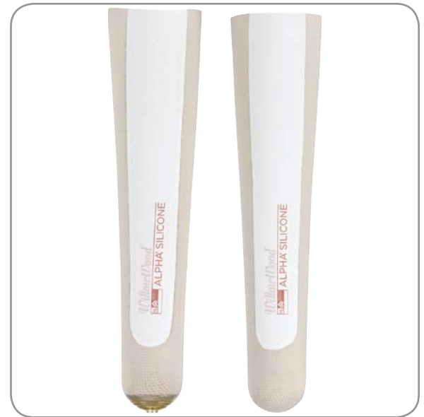
Alpha Silicone Liner (Select Fabric) Progressive Style